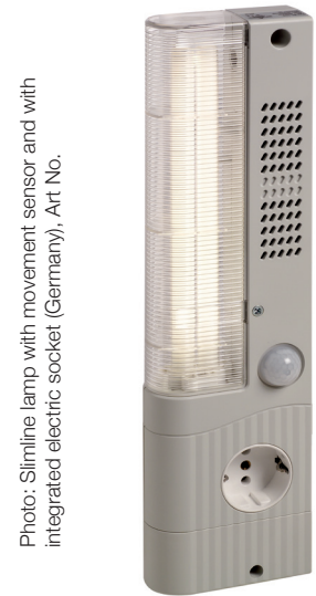
Photo: Slimline lamp with movement sensor and with integrated electric socket (Germany), Art No.