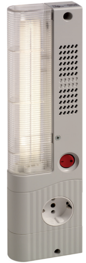
Photo: Slimline lamp with on/off switch, with integrated electric socket (Germany), Art No.