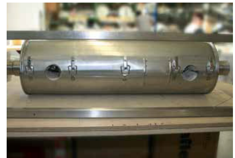
Heating jacket with sheet metal outer jacket.