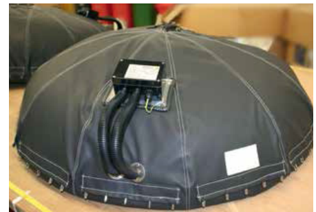
Heating jacket for hazardous locations, semi-round.